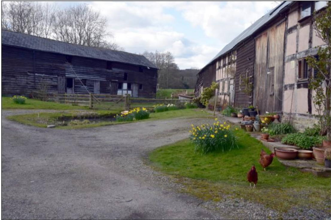
YARPOLE Church Farm

b) New housing upon this site should meet the needs of the community in terms of size by including a mix of properties including predominantly small and medium sized family homes in order to address needs identified within the Local Housing Market Assessment (see Table 2). The developer should indicate how it is proposed to contribute towards the needs identified, particularly in terms of house size. Departure from proportional needs may be accepted where development provides especially for particular local community.