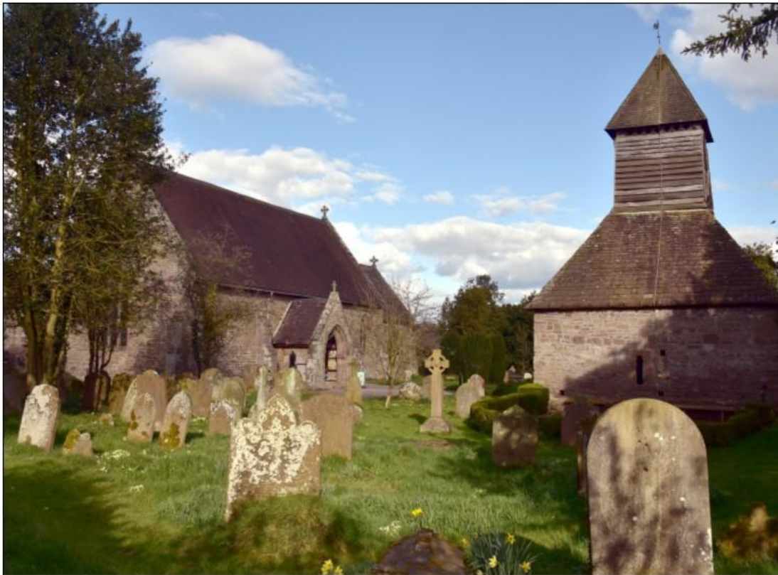
YARPOLE Saint Leonards Church and Belltower

6.14 Both the land in front of Vicarage Farm and that opposite comprising the graveyard with the old orchard towards Brook House contribute to an open green space within the village centre in the foreground of St. Leonard's Church. St. Leonard's Church is a Grade II* Listed Building while the separate square tower just to its south is Grade I. The majority of buildings which surround this space are also Listed Buildings. This policy therefore seeks to protect the setting of these Listed Buildings as well as the retention of green infrastructure.