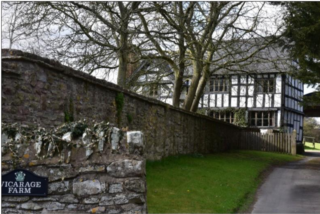
YARPOLE Vicarage Farm

and the need to achieve high quality and sustainable design, especially incorporating measures that would result in development being carbon neutral.