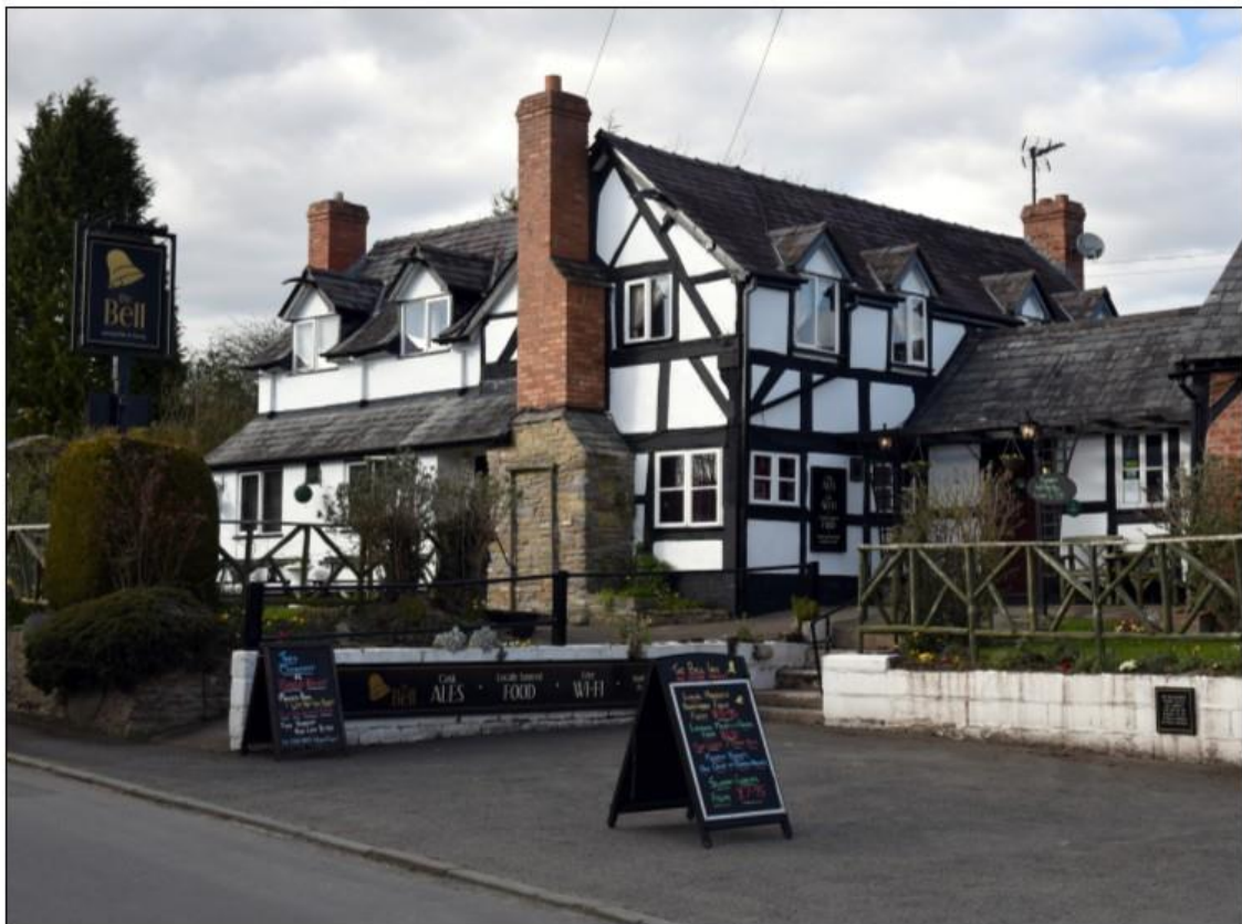
YARPOLE Bell Inn