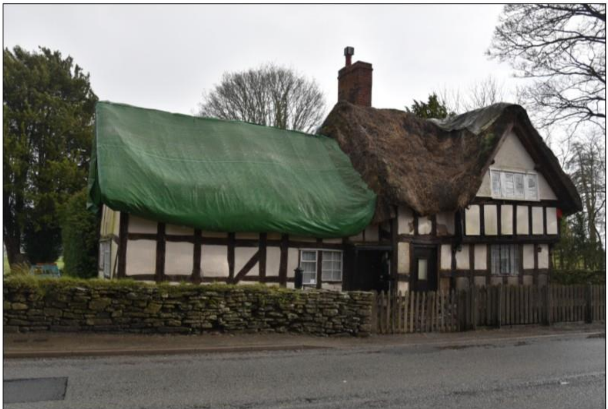
BIRCHER Knoll Cottage