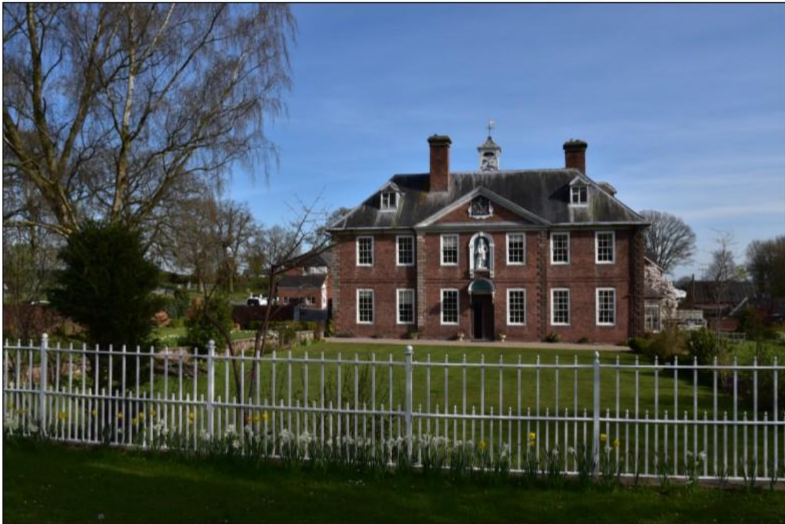
LUCTON School Est.1708