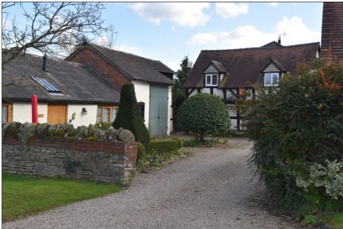
YARPOLE Upper House Farm