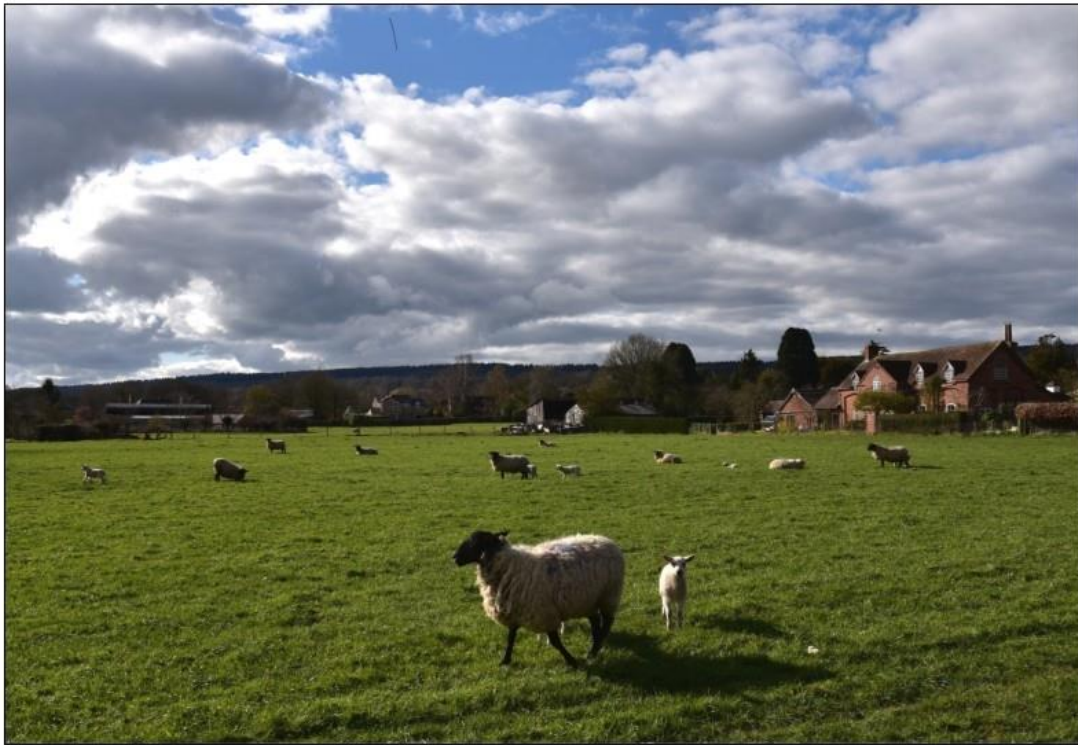
YARPOLE Lower House / Brookhouse Farms