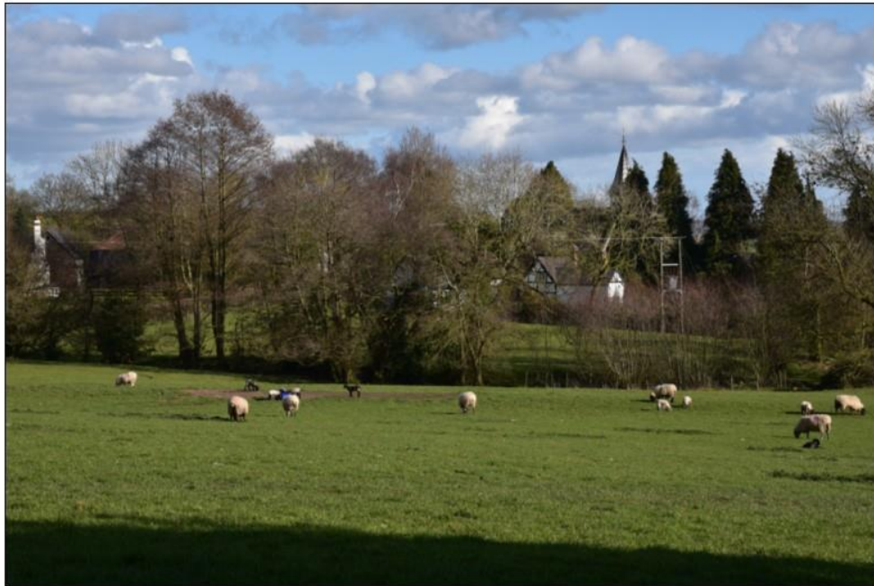
LUCTON Archaeological site

biodiversity and heritage value and for the contribution it makes to the character, appearance and setting of Lucton Conservation Area. Except in very special circumstances, no development will be permitted which would adversely affect the special qualities of the area and the contribution these make to the village's environment.